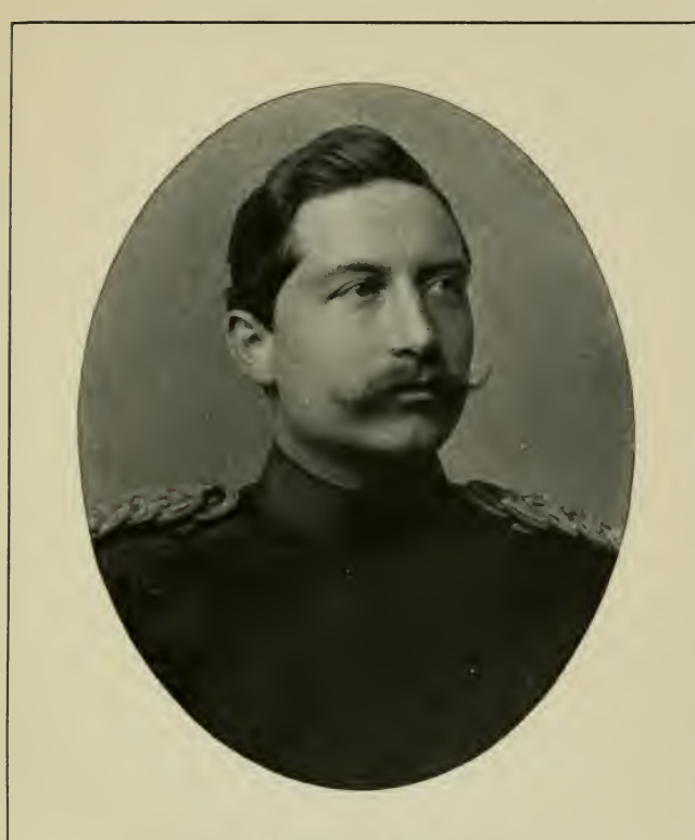
THE EMPEROR IN THE YEAR OF HIS CORONATION, 1888 [{\rm Age}~29]